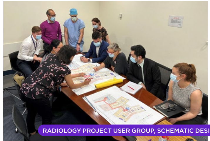
RADIOLOGY PROJECT USER GROUP, SCHEMATIC DESIGN

At the absolute centre of the planning design and delivery of the project, and particularly in the Schematic Design phase, is a focus on the needs of patients, both current and future.