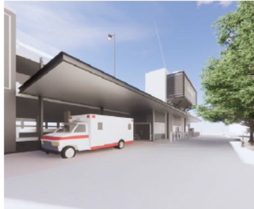
ARTIST IMPRESSION OF THE TEMPORARY HELICOPTER LANDING SITE VIEW FROM GROSE STREET

Please contact us with any questions you have about our work. We will continue to provide you with updates throughout this project.