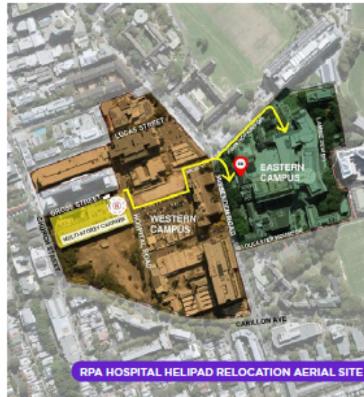
RPA HOSPITAL HELIPAD RELOCATION AERIAL SITE VIEW

Operating from 2024, the temporary helipad will be located on the roof of the multi-storey carpark off Hospital Road and Grose Street, south of the Queen Mary Building. The temporary helipad relocation is expected to be needed for up to 24 months.