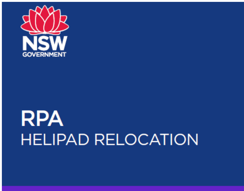
Figure 4: HLS Temporary Relocation 'sorry we missed you' flyer